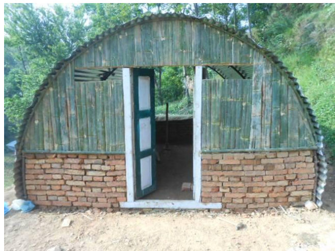
Fig: Model 4 and Model 5