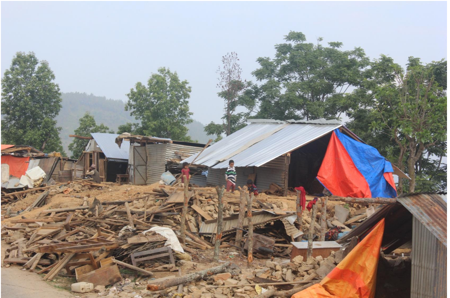
Photo: Harre, where every houses of villagers destroyed by quake