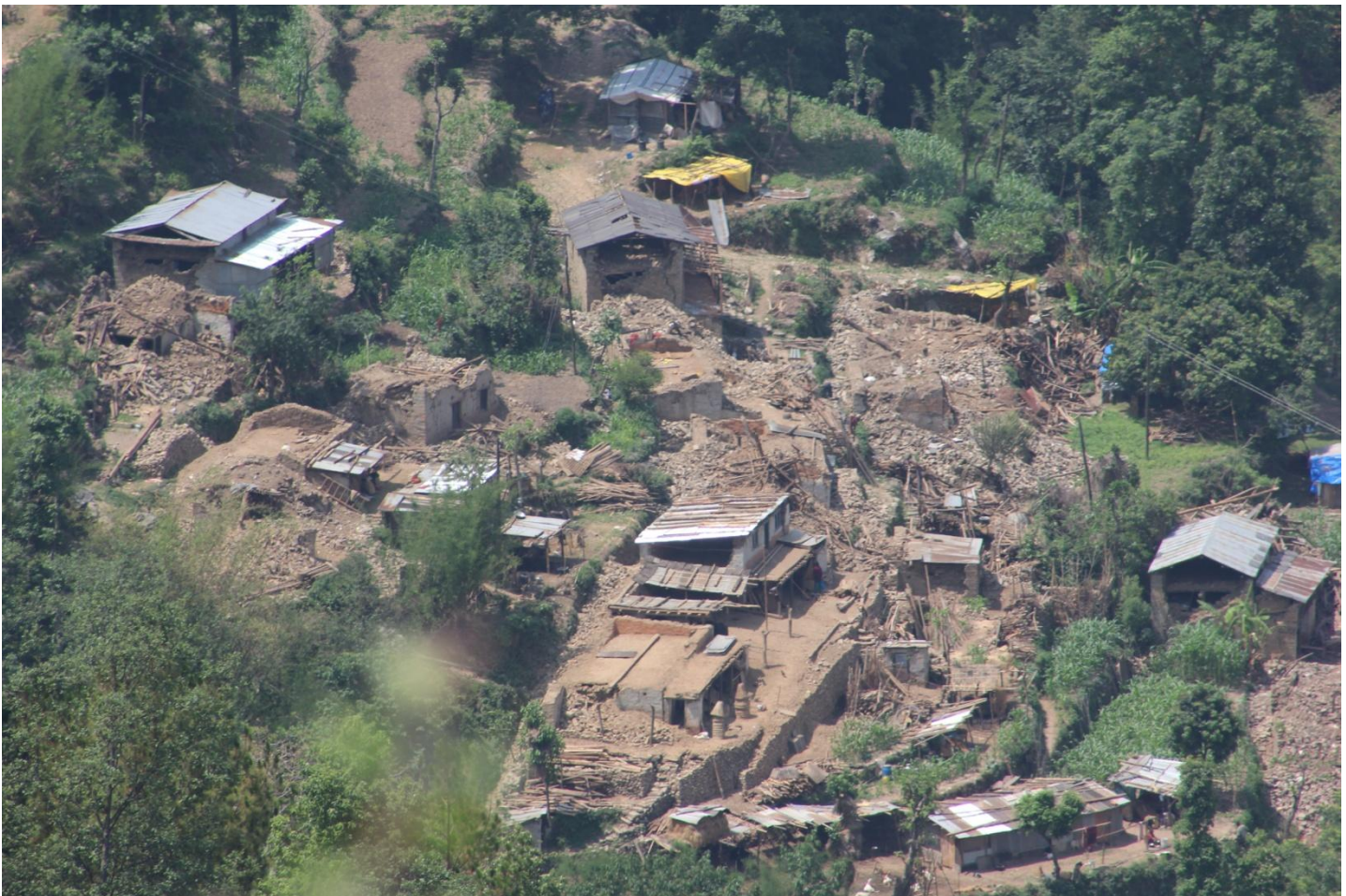
Photo: One village of Sangachok Sindhupalchowk completely devastated by Earthquake

Most of the victims are villagers and many of them do not have anyone earning in their family. They are living in an open sky even tents are not available to many of them till now. We can't imagine how difficult to live in an open sky.