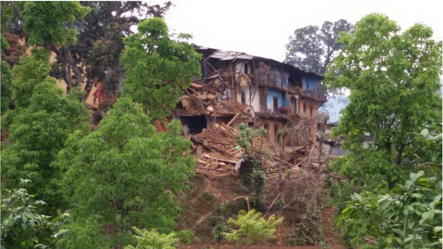
Photo: One house of Sangachok where rice, millet and maize buried along with destroyed house.

Distribution should be: Sangachok Panichaur: 90 Farmer, Harre: 90 Farmer, Lubhu & Lakurivanjyang: 70 farmers