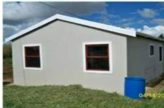
Fig: Model 3