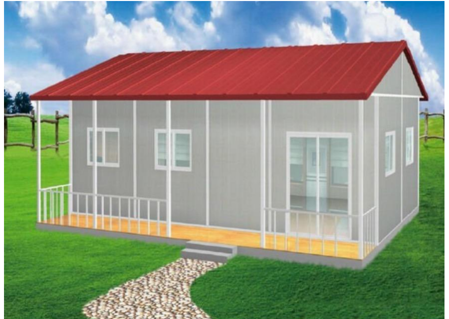
Fig: Model 1 and Model 2