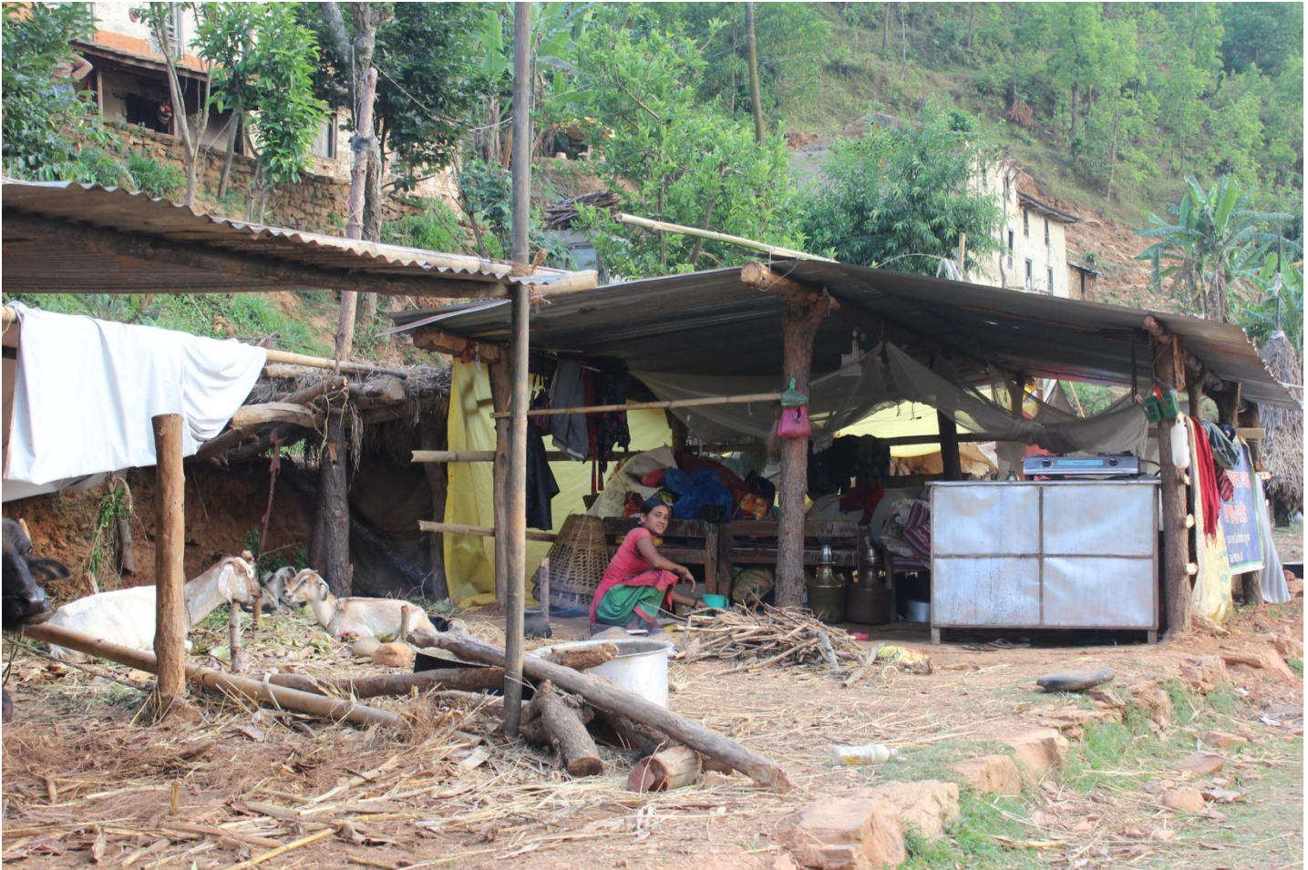
Photo: Temporary settlement without fence built by victims after earthquake at Sangachok